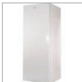
Frigider ARCTIC 255 l EUR 80.00 Cod 025 010 020 199