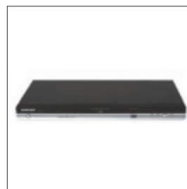
DVD Player EUR 55.00 Cod 025 010 130 030