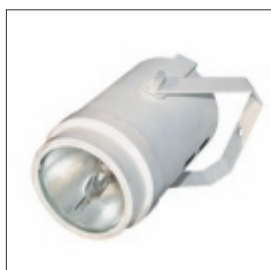
Reflector HQI 80W EUR 50.00 Cod 019.010.200.030