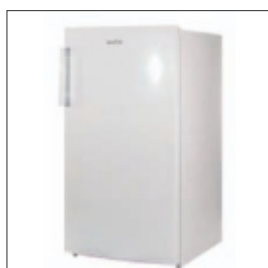
Frigider ARCTIC FB 155 EUR 36.00 Cod 025 010 020 198