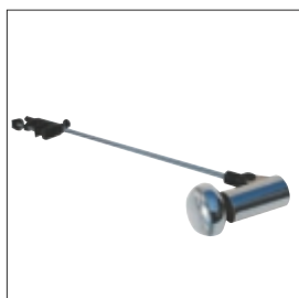
Lampa spot cu brat EUR 21.00 Cod 019.010.180.000