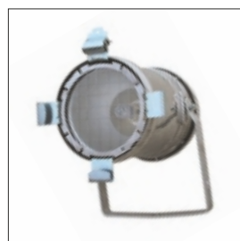
Reflector HIGHLITE HQI 150W 50.00 EUR Cod 019.010.390.000