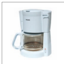
Filtru de cafea EUR 10.00 Cod 025.010.120.010