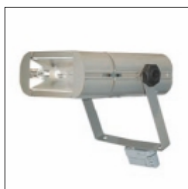
Reflector IVEN HQI 150W EUR 50.00 Cod 019.010.200.005