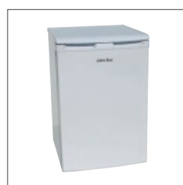
Racitor (140 l) EUR 33.00 Cod 025 010 070 010 (55 x 61 x 84 cm)