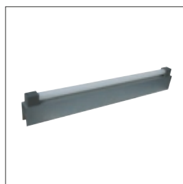
Corp fluorescent tip SS30 EUR 24.00 cu un tub D-170 Cod 019.010.190.000