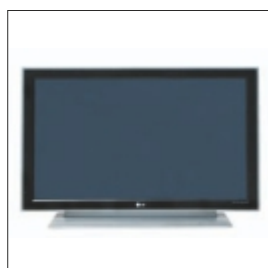
TV Plasma EUR 36.00/zi (diagonala ecran: 107 cm) Cod 025 010 130 040