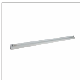
Lampa fluorescenta FIA EUR 24.00 cu instalatie electrica completa 1x40W Cod 019.010.110.000