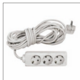
Prelungitor 230V, 10A, 5m EUR 18.00 Cod 019.010.279.000