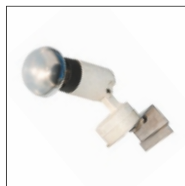
Lampa spot SS30 100W EUR 21.00 Cod 019.010.200.008