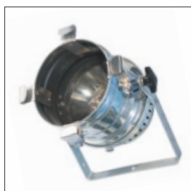
Reflector PAR64 500-1000W EUR 55.00 Cod 019.010.200.020