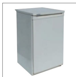
Frigider ARCTIC (180 l) EUR 59.00 Cod 025 010 070 020