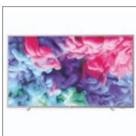
TV LED SMART 4K, UHD ultrasubtire EUR 55.00/zi (diagonala ecran: 126 cm) Cod 025 010 130 045