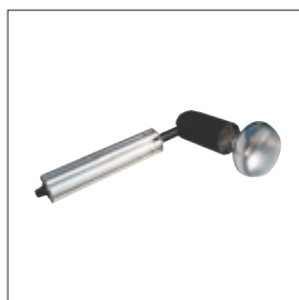
Lampa spot stut OCTANORM EUR 21.00 Cod 019.010.187.000