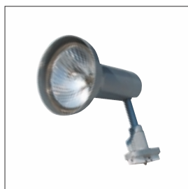
Spot halogen SYSTAR100W EUR 24.00 Cod 019.010.185.000