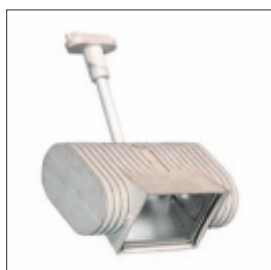
Reflector halogen SYMA STAR 300W EUR 50.00 Cod 019.010.200.006