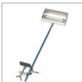
Reflector cu brat 300W EUR 50.00 Cod 019.010.200.010