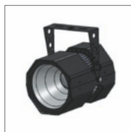
Reflector LED VIRGO EUR 55.00 40W 4350 LM 4100 K Cod 019.010.200.045