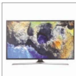
TV SAMSUNG UHD, EUR 85.00/zi (diagonala ecran: 163 cm) Cod 025 010 130 047