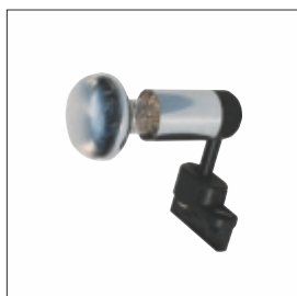
Lampa spot 100W EUR 21.00 Cod 019.010.188.000