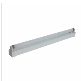
Corp fluorescent tip SS30 EUR 27.00 cu un tub D-170 - A Cod 019.010.190.001