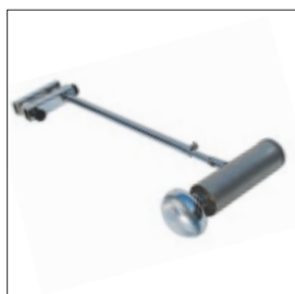
Lampa spot cu brat 100W EUR 21.00 Cod 019.010.181.000