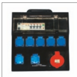
Panou Electric 380V/220V EUR 130.00 Cod 019.010.265.000