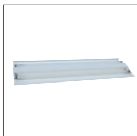
Corp fluorescent tip OCTANORM EUR 29.00 cu doua tuburi D-171 Cod 019.010.200.000