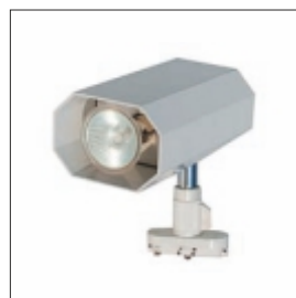
Spot halogen SYSTAR 50W(A) EUR 24.00 Cod 019.010.186.000