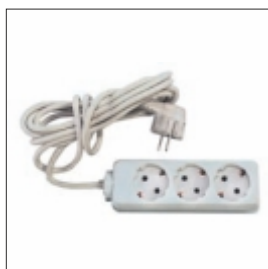
Prelungitor 230V, 10A, 3m EUR 18.00 Cod 019.010.277.000