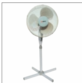
Ventilator cu picior EUR 14.00 Cod 025.010.500.020