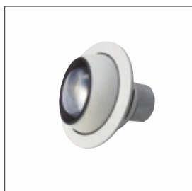
Lampa spot 100W EUR 21.00 Cod 019.010.170.000