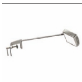
Reflector tija LED A++ EUR 50.00 16W 1100LM 4000K ARM33CM Cod 019.010.200.040