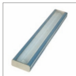
Corp fluorescent tip SYMA STAR EUR 27.00 Cod 019.010.200.001